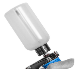
Threaded PVC Bottle