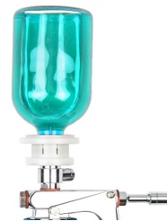
Mutifit Bottle Holder