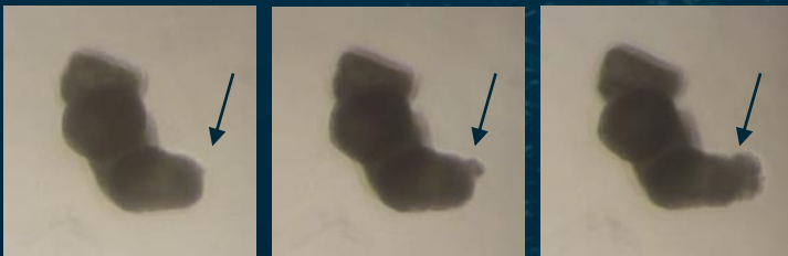
Time lapse shows the effect of Biokos™ on Ichthyophthirius multifiliis tomonts when released in the water.

Al-Jubury, A. et al., Copenhagen University, Journal of Fish Diseases 41:1147– 1152.