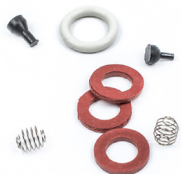
Spares Kits available for all our syringes