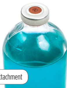
with Multifit Attachment

All our syringe models are tube-feed as standard, and come with a basic feed needle and length of PVC tubing