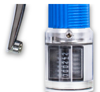
Magnetic Counter attachment accurately counts number of doses