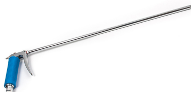
Variety of long delivery stems maintain distance between user and animal