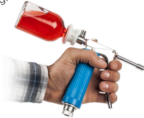
Ovijector 2ml shown with Multifit attachment

The globally trusted solution for injection in all species