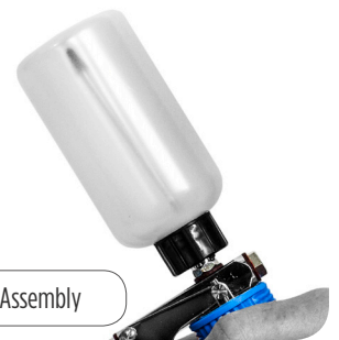
with Cap Assembly

The Multifit attachment allows reliable direct connection of standard medicine bottles