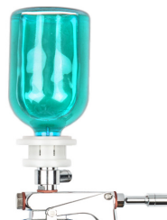
Multifit Bottle Holder