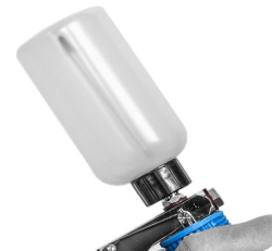
Threaded PVC Bottle