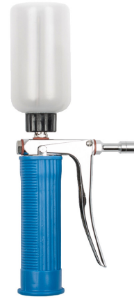
(example: Minijector PVC Bottlemount)

Handheld Repeater Syringe 0.1 or 0.2ml Fixed Dose