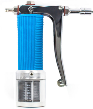
(example: Fishjector rear-feed with Counter Option)